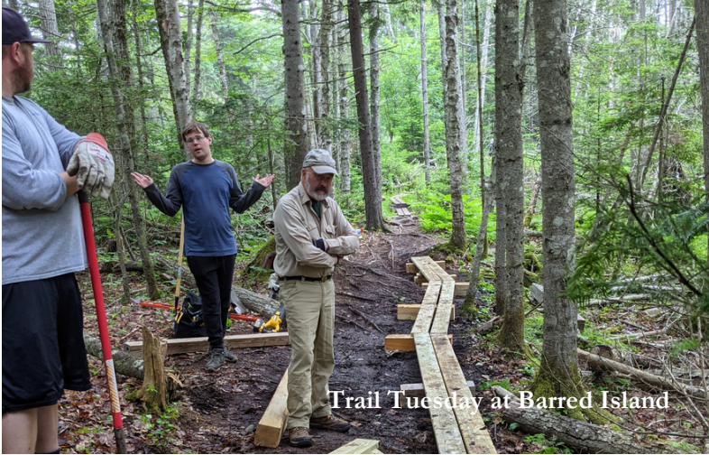
Trail Tuesday at Barred Island

We have heard from many of you how wonderful your experiences on the trails have been of late – thank you!