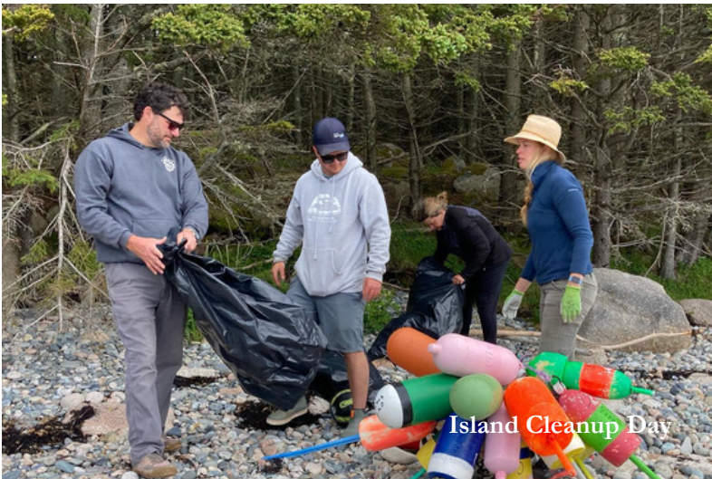
Island Cleanup Day