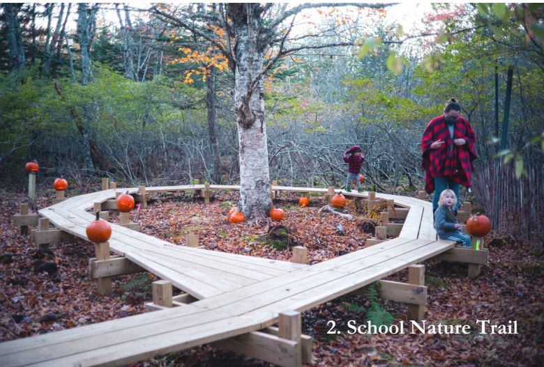
2. School Nature Trail