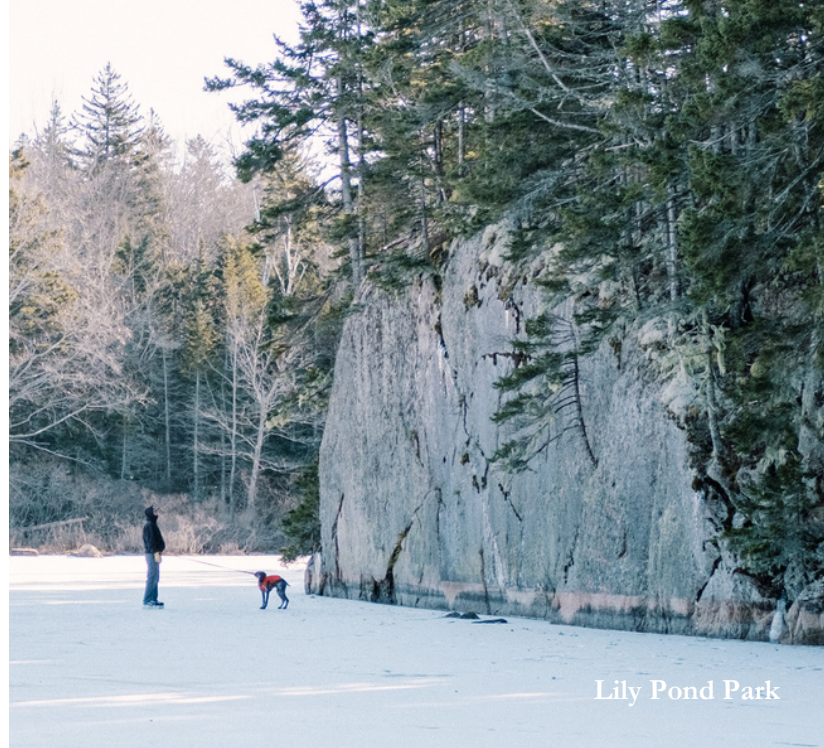
Lily Pond Park