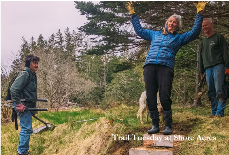
Trail Tuesday at Shore Acres