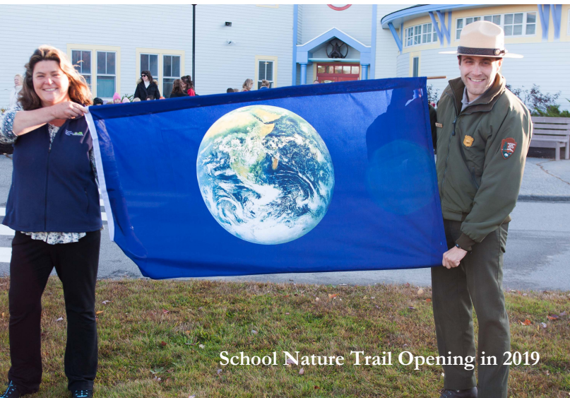
School Nature Trail Opening in 2019