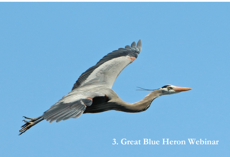
3. Great Blue Heron Webinar