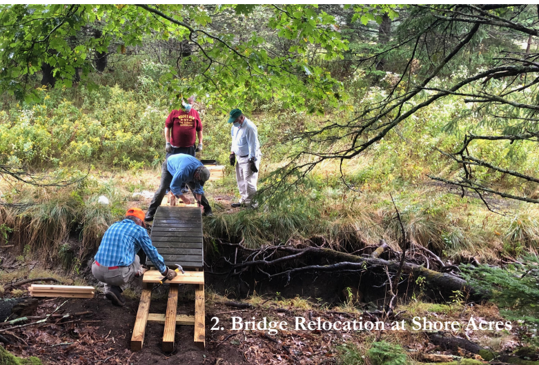
2. Bridge Relocation at Shore Acres