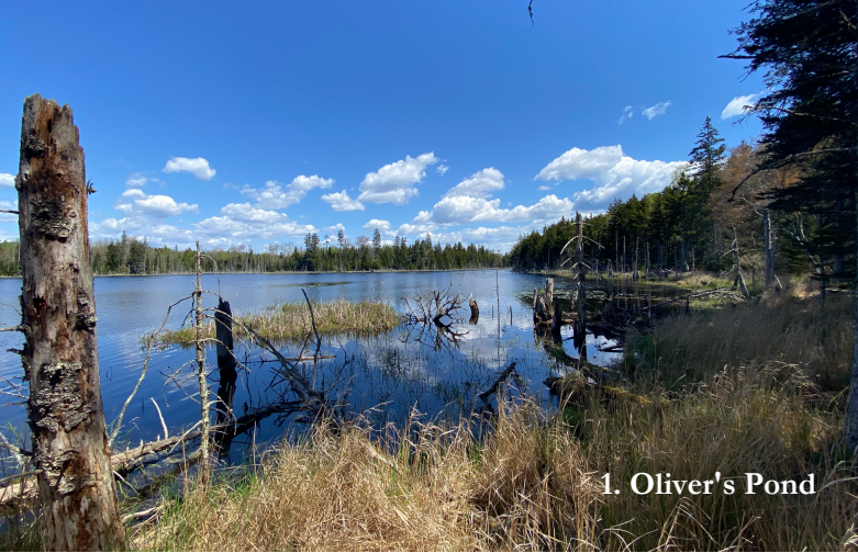
1. Oliver's Pond