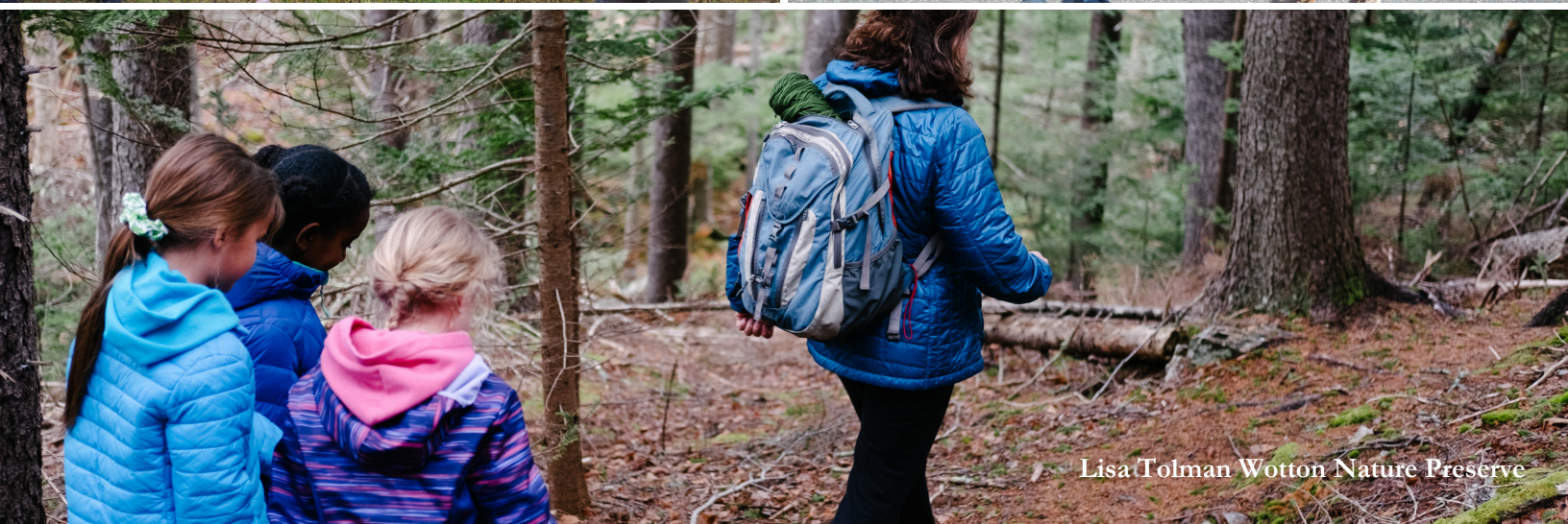
Lisa Tolman Wotton Nature Preserve