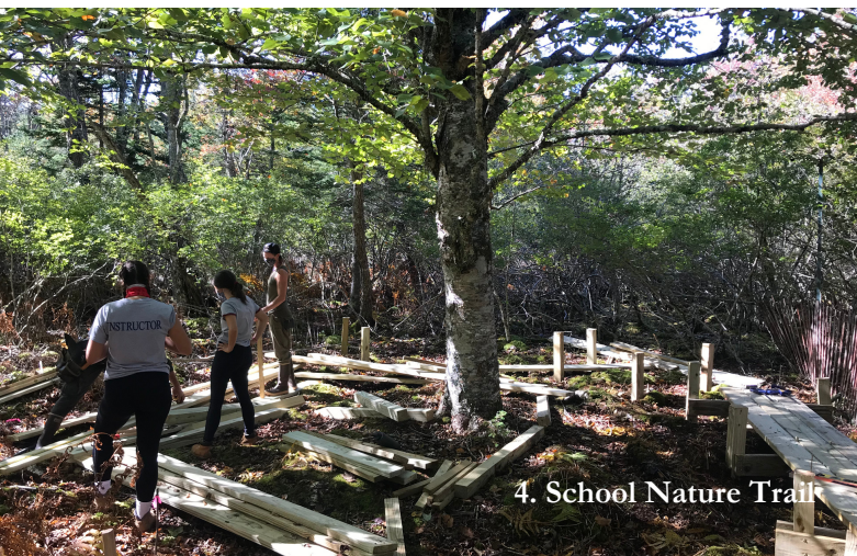
4. School Nature Trail