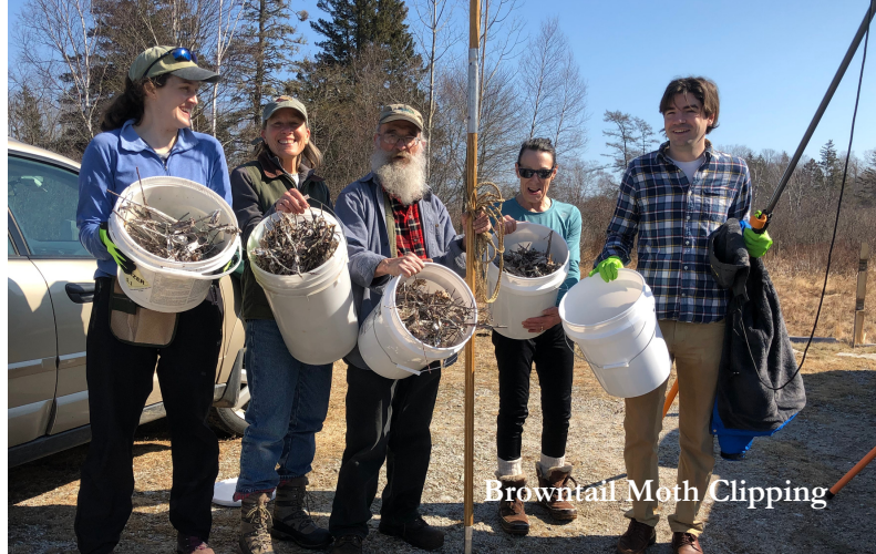
Browntail Moth Clipping