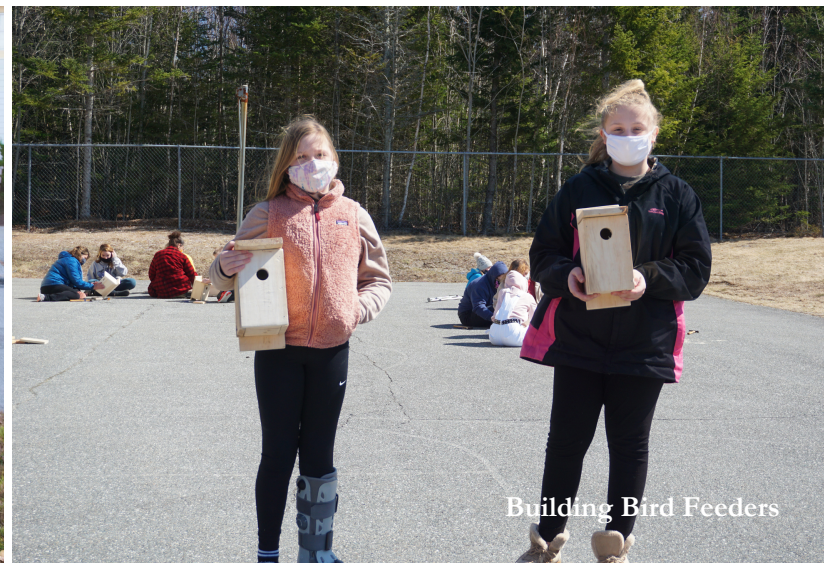
Building Bird Feeders