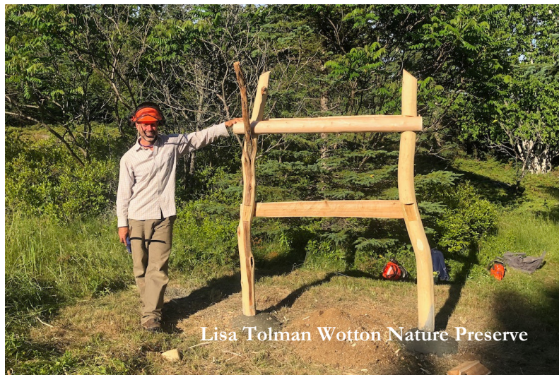
Lisa Tolman Wotton Nature Preserve