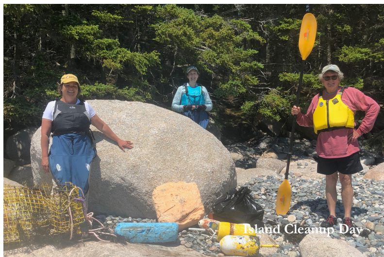
Island Cleanup Day