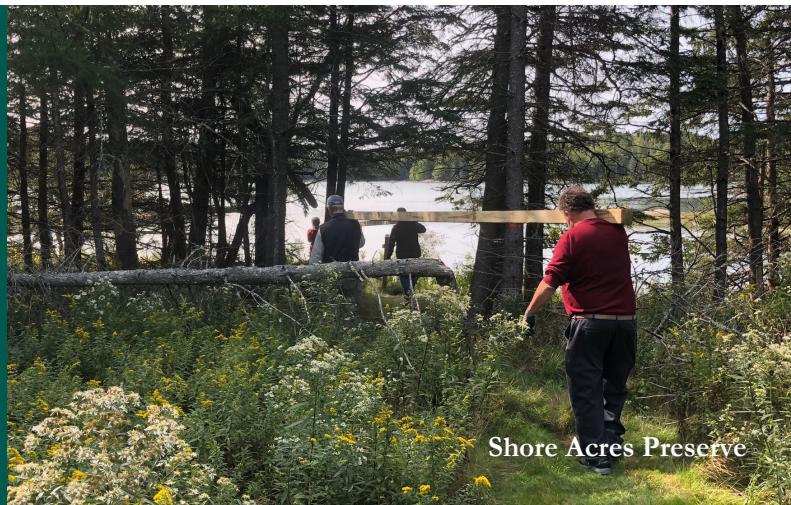
Shore Acres Preserve