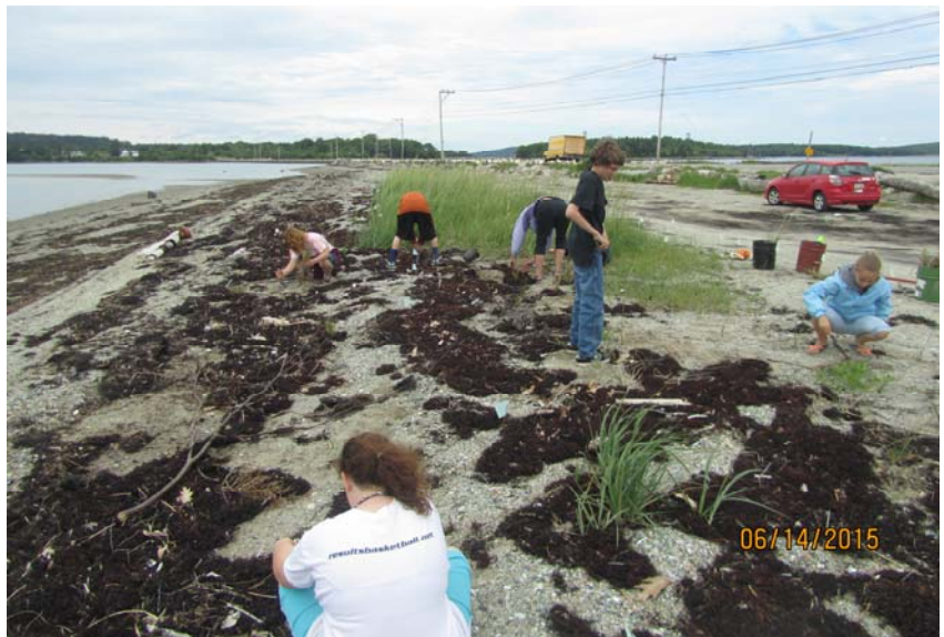
Seventh grade Beach Grass Project—Causeway Beach